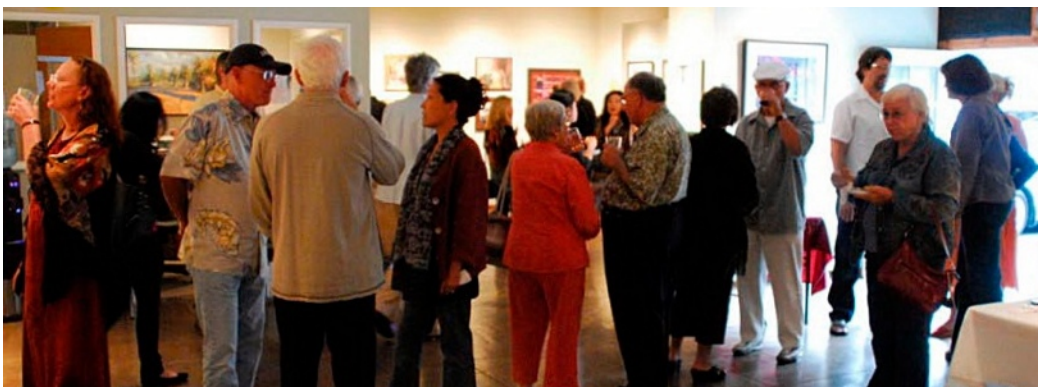
Recent SoCal Artists Opening Reception

Contact us at info@socalartists.org for further entry or membership information.