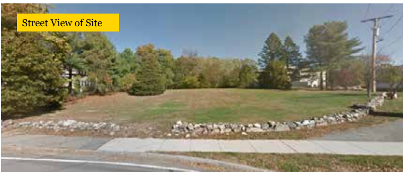
Street View of Site